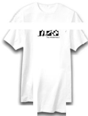
Image: Kangaroo-Lizard-Butterfly-Kangaroo Paw Price: $31.00 Plus shipping Plus surcharge for XXL t-shirts