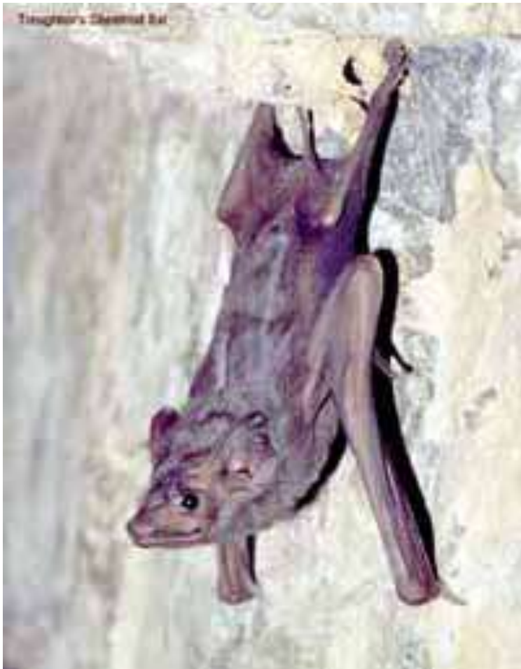
Troughton's sheathtail bat