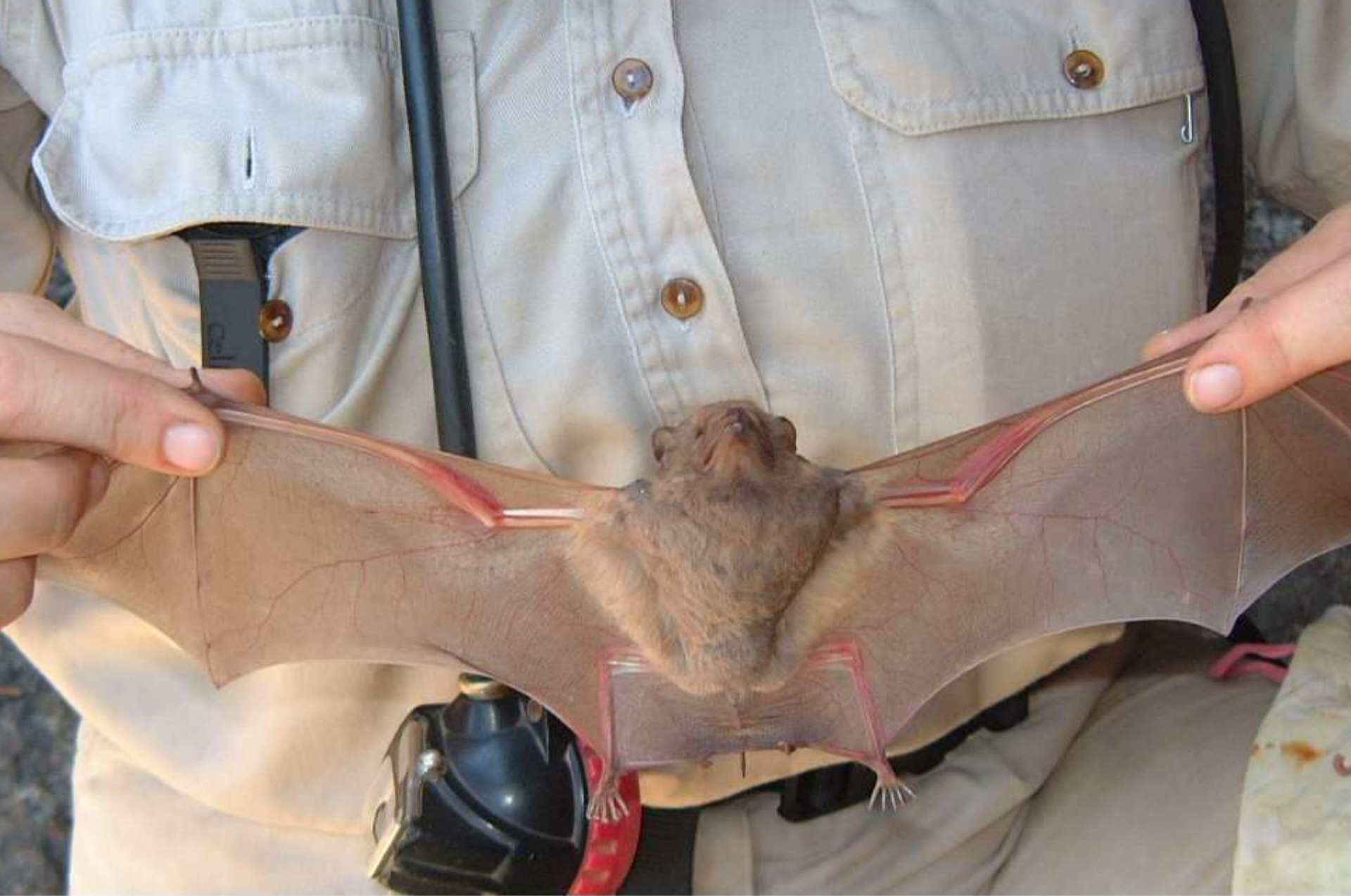
A sheath-tail bat, showing the sheath tail.