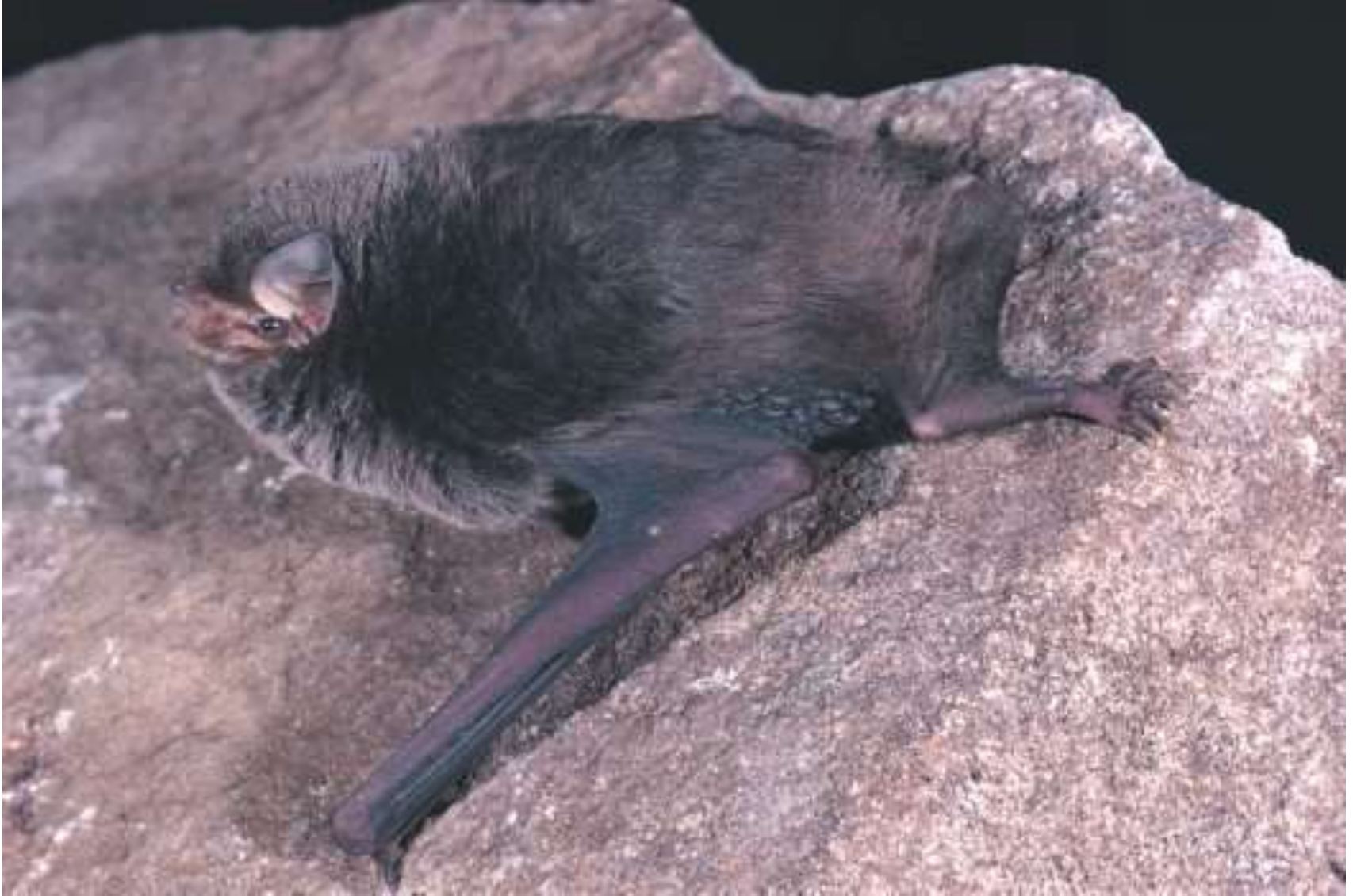
Little bentwing bat Miniopterus australis