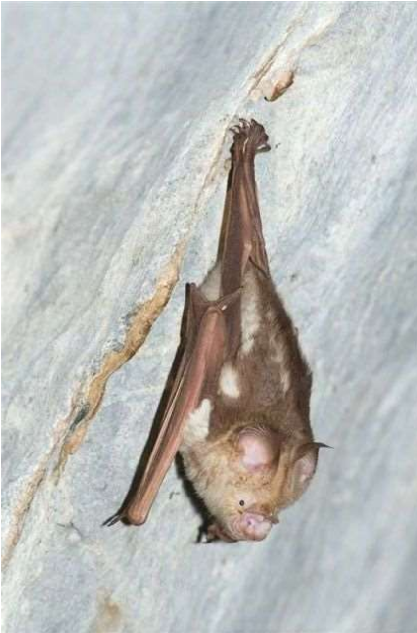
Diadem leaf-nosed bat Hipposideros diadema