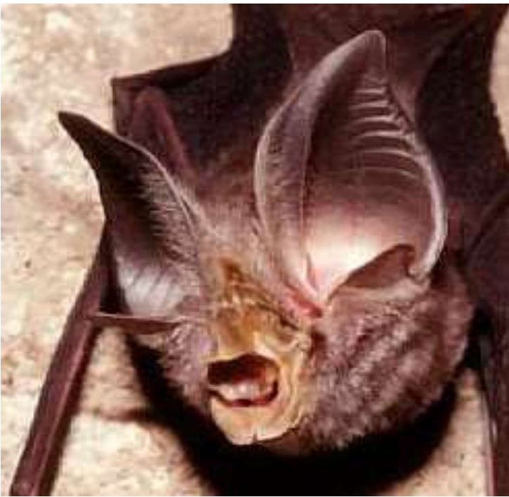
Large-eared horseshoe bat Rhinolophus philippinensis / Rhinolophus robertsi