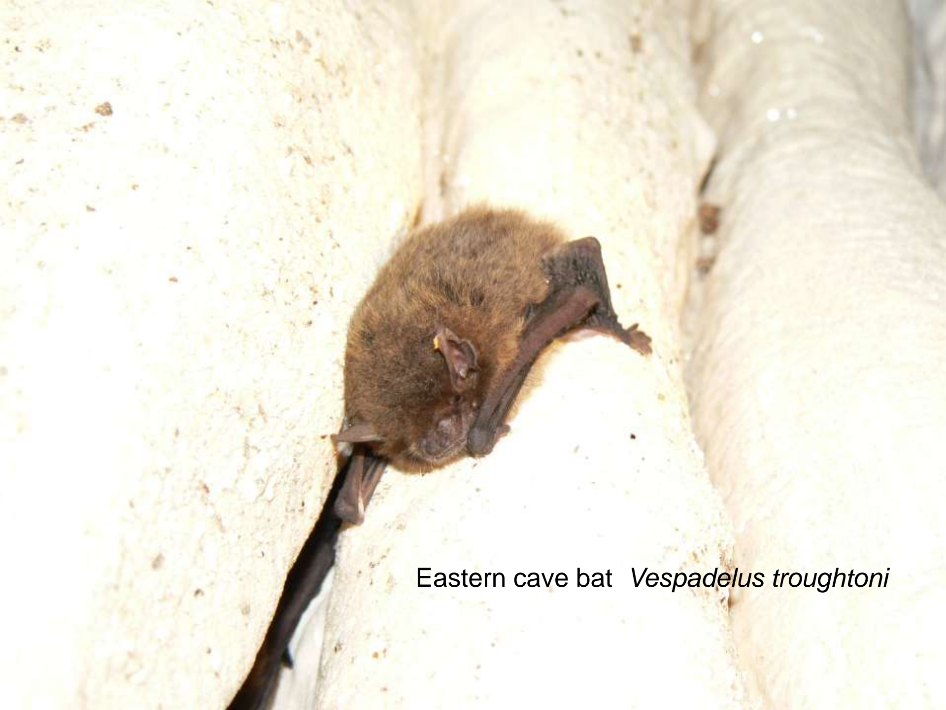
Eastern cave bat Vespadelus trougtoni