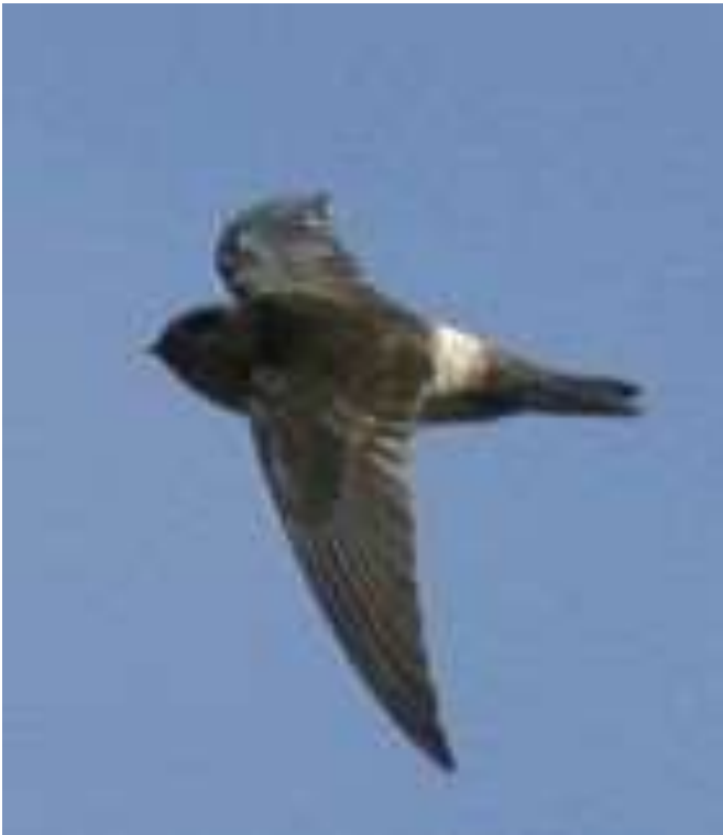
Australian swiftlet or White-rumped swiftlet