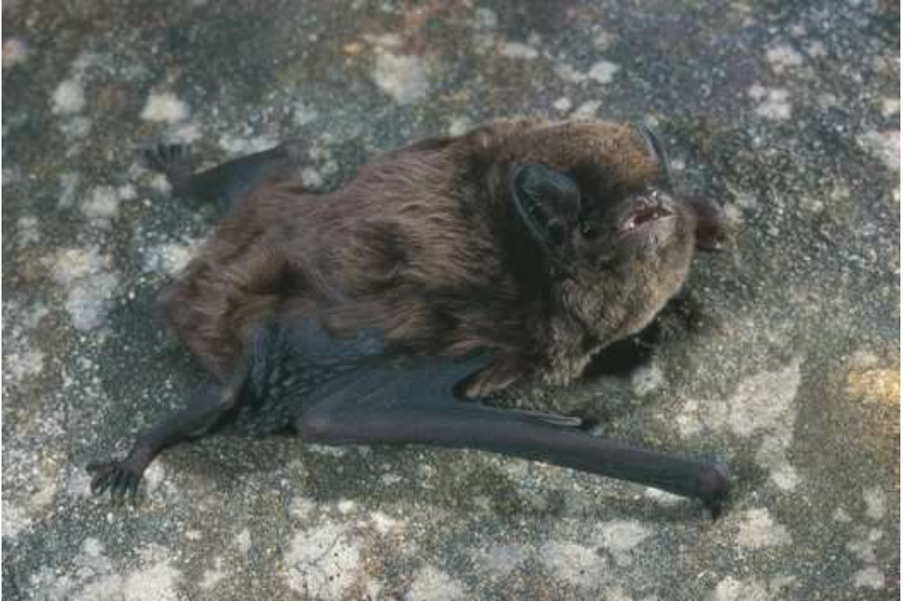
Eastern bentwing bat Miniopterus orianae oceanensis