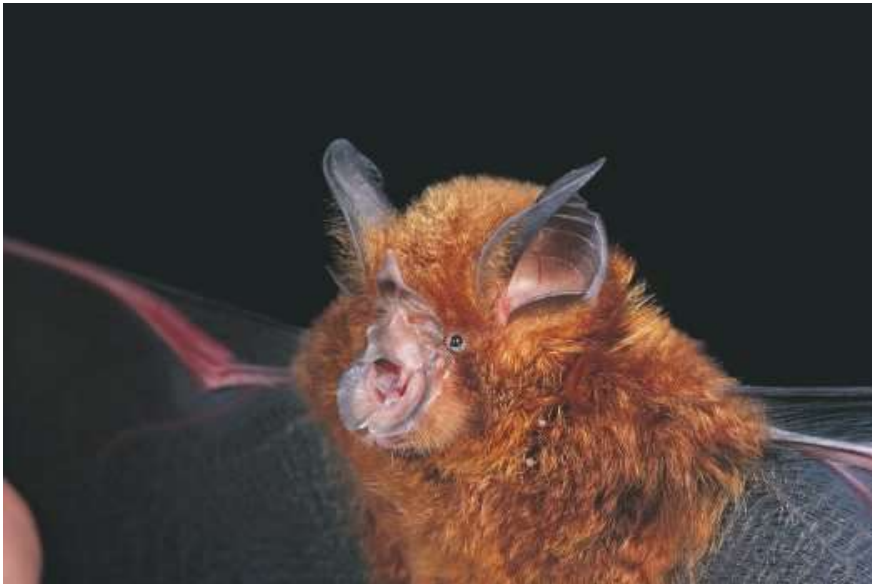
Eastern horseshoe bat Rhinolophus megaphyllus