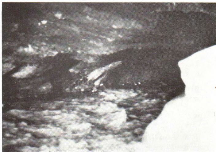
bottom: Franz Josef outflow cave. The left wall appears to be bedrock, the roof and right walls are ice