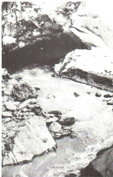
above: Outflow cave, Franz Josef Glacier, January 1972