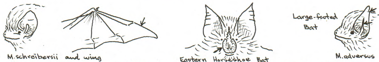
Figure 1 : Some distinguishing characteristics

When collecting data for the survey cards, careful note of Hamilton-Smith's (1970) recommendations on the conservation of bats should be taken. In brief there are three considerations: