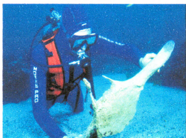
Whale vertebrae found at Ulladulla near a dive site called The Lighthouse.

To see underwater you must make your own mask 1949 style.