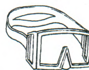
Face mask 2004 style.